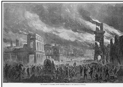
Columbia, South Carolina