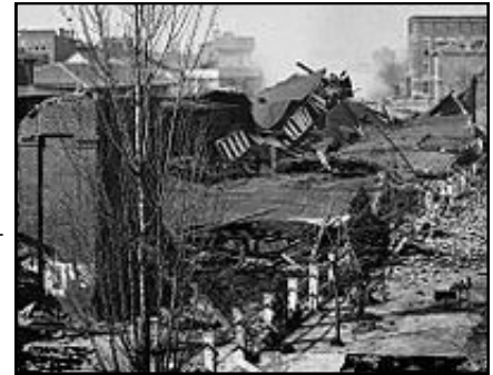
Atlanta's Union Station